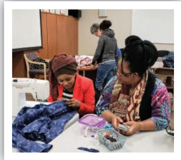
Top (from left): Over the years, Naomi House has been “home” to 51 people; Naomi House is complete with a rooftop garden; Newcomers participate in a sewing class. Bottom (from left): Naomi House supports its residents by addressing physical, spiritual, and emotional needs; Despite the COVID-19 pandemic, more young adults began attending the evening Bible study.